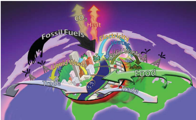
Figure 2. Pictorial illustration of important flows of resources into and wastes out of Portland, Oregon. This “most sustainable city in America” depends on exchanges with the local, regional, and global environments and economies in which it is embedded. doi:10.1371/journal.pbio.1001345.g002